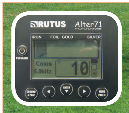
Nail ID graph.