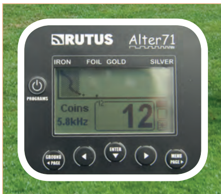
Large iron ID graph.