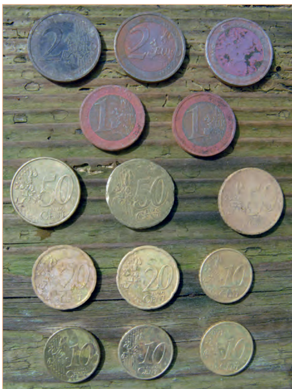
Two-metal alloy coins.

On a different note, but also relating to TIDs, the Coins Program with low 5.4kHz produced the best separation of