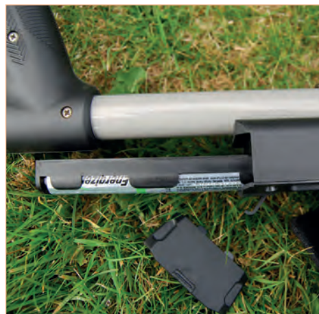
The Rutus Alter 71 battery compartment (left) and control box trigger (below).

The Alter 71 has dispensed with all that and its numbering system in the menu and option choices are all over