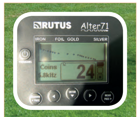
Trash target ID graph.