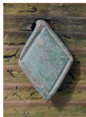
Diamond shaped pin.