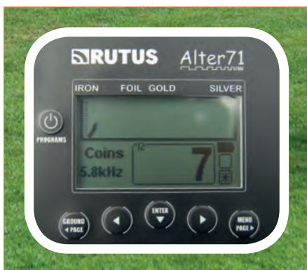
ID graph can show angle of nails.

the place! This is a common factor with Eastern European and Russian detecting systems but mild confusion can occur when experienced for the first time.