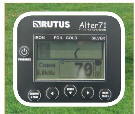
Buckle ID graph.