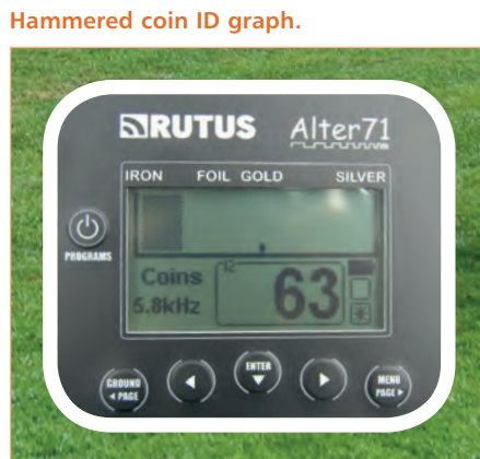
Hammered coin ID graph.