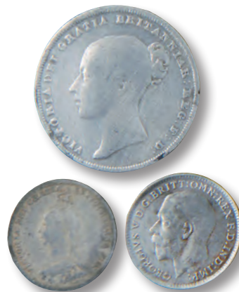
Silver coins (above) and medal from garden (below).

Two searches were conducted in woodland that I have been visiting for many years. On the first day I used the 8 inch CC coil and the second day I used the bigger coil.