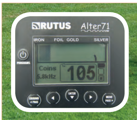
Coin ID graph.

The Instruction Manual states that: "Most soil types give a phase reading of around -87.0."